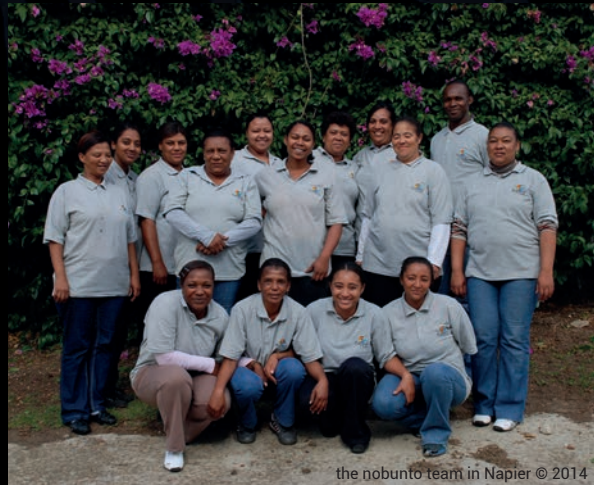
the nobunto team in Napier © 2014

Based in the small village Napier, about 180 km east of Cape Town, nobunto has provided employment to mostly woman of the disadvantaged community and guarantees a fair income for our employees. The unemployment rate in the area is in the region of 50%.